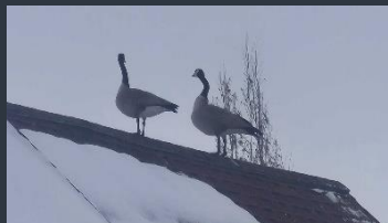
Visitors at Ardrossan United Church wondering what happened to Spring this past weekend!

"Foremost among them was Iona, a rocky, near-treeless landmass in the Inner Hebrides that served as a first foothold of Christianity in early medieval Britain. Monks here followed a mystical, nature-focused faith, under the guidance of Saint Columba, who'd famously braved the fury of the Atlantic sailing to Iona from his native Ireland in an improbably tiny coracle. Today (for all but a few people), getting to Scotland's holy island demands travellers make a long, challenging journey by road, rail and ferry. In effect, it demands a pilgrimage for those who seek to step on its shores."